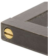
STEEL + FLAT BRASS