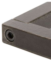
STEEL + HEX BLACK