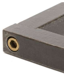
STEEL + HEX BRASS